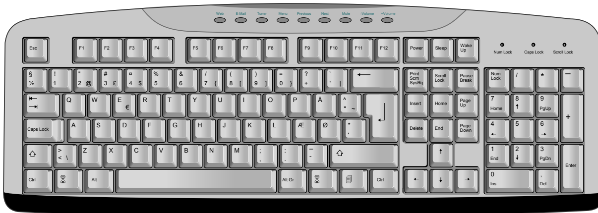
Figure 2: This figure floats to the top of the page, spanning both columns.